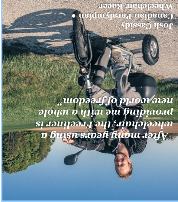
After many years using a wheelchair, the Freeliner is providing me with a whole new world of freedom"