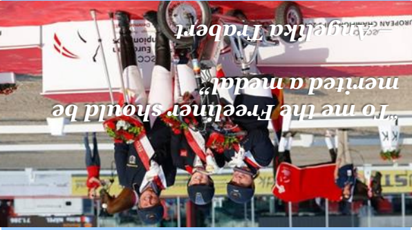
"To me the Freeliner should be merited a medal"